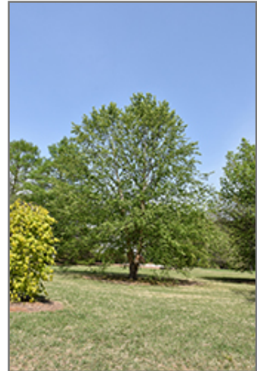
Dura Heat River Birch