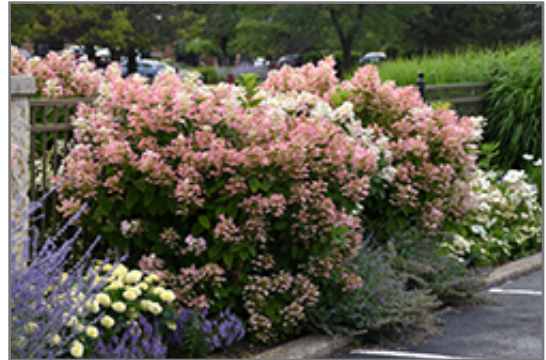
Quick Fire Hydrangea in bloom