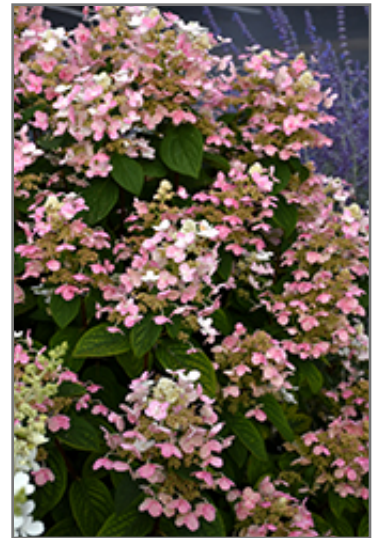
Quick Fire Hydrangea flowers