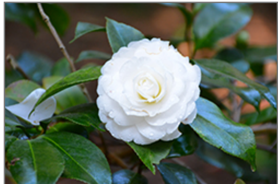
Alba Plena Camellia flowers