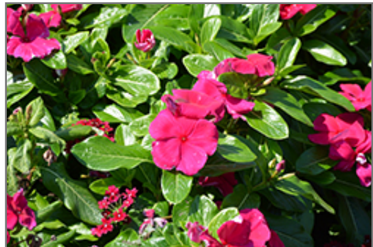
Cora Cascade Magenta Vinca flowers

Cora Cascade Magenta Vinca is recommended for the following landscape applications;