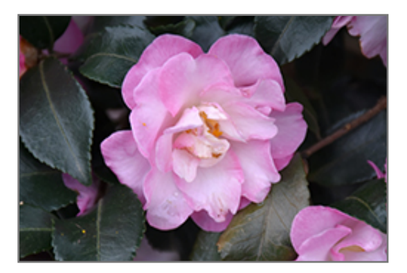
October Magic Orchid Camellia flowers