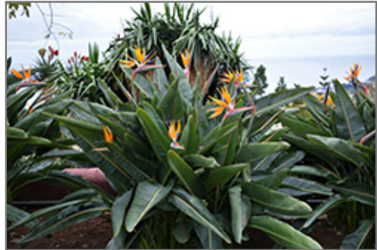
Orange Bird Of Paradise in bloom