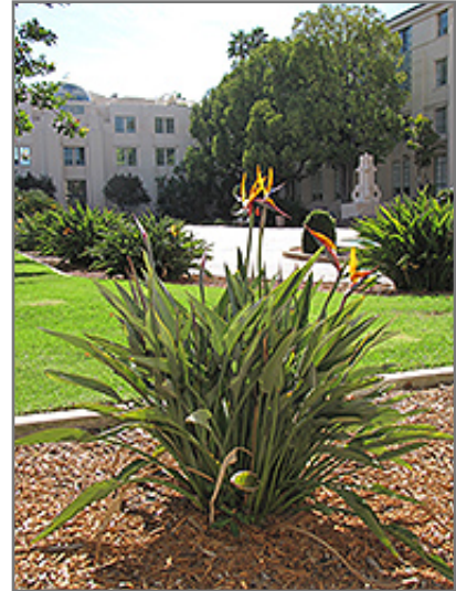
Orange Bird Of Paradise in bloom

Orange Bird Of Paradise is a fine choice for the garden, but it is also a good selection for planting in outdoor pots and containers. With its upright habit of growth, it is best suited for use as a 'thriller' in the 'spiller-thriller-filler' container combination; plant it near the center of the pot, surrounded by smaller plants and those that spill over the edges. It is even sizeable enough that it can be grown alone in a suitable container. Note that when growing plants in outdoor containers and baskets, they may require more frequent waterings than they would in the yard or garden.