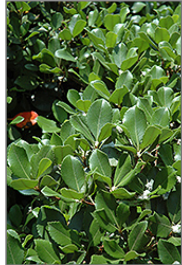
Eleanor Taber Indian Hawthorn foliage

This shrub does best in full sun to partial shade. It prefers to grow in average to moist conditions, and shouldn't be allowed to dry out. It may require supplemental watering during periods of drought or extended heat. It is not particular as to soil type or pH. It is somewhat tolerant of urban pollution. This is a selected variety of a species not originally from North America.