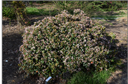
Eleanor Taber Indian Hawthorn in bloom

Eleanor Taber Indian Hawthorn is recommended for the following landscape applications;