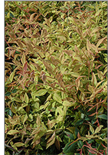
Gulf Stream Dwarf Nandina foliage