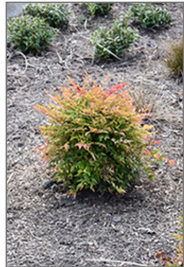
Gulf Stream Dwarf Nandina