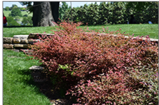
Flirt Nandina