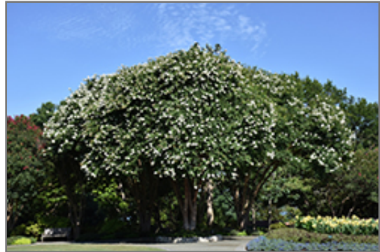
Natchez Crapemyrtle in bloom