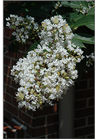
Natchez Crapemyrtle flowers

Natchez Crapemyrtle is recommended for the following landscape applications;