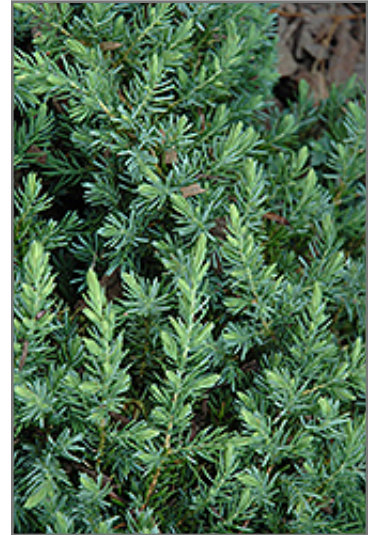
Blue Pacific Shore Juniper foliage