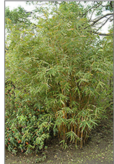
Alphonse Karr Bamboo foliage