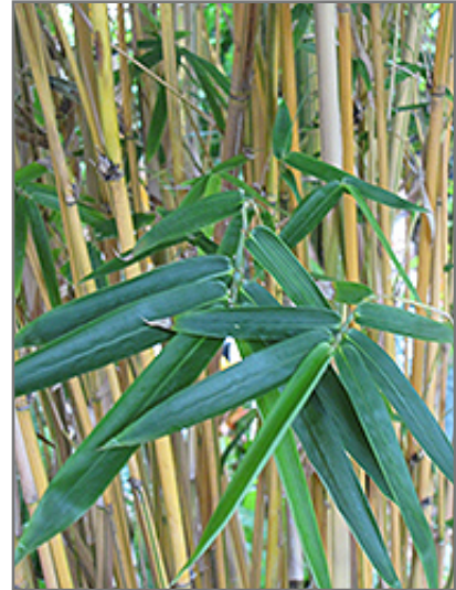
Alphonse Karr Bamboo foliage

* This is a 'special order' plant - contact store for details