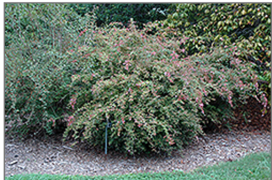
Edward Goucher Abelia in bloom