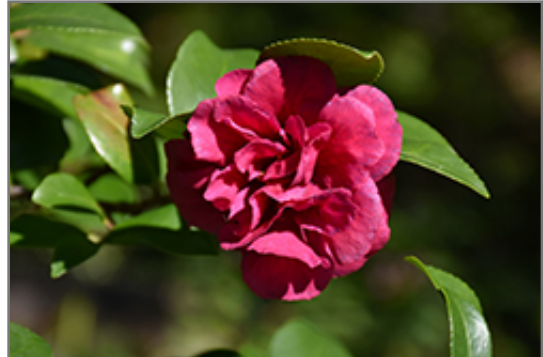
Bonanza Camellia flowers