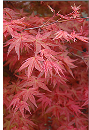
Suminagashi Japanese Maple foliage

This tree does best in a location that gets morning sunlight but is shaded from the hot afternoon sun, although it will also grow in partial shade. Keep it away from hot, dry locations that receive direct afternoon sun or which get reflected sunlight, such as against the south side of a white wall. It prefers to grow in average to moist conditions, and shouldn't be allowed to dry out. It may require supplemental watering during periods of drought or extended heat. It is not particular as to soil pH, but grows best in rich soils. It is somewhat tolerant of urban pollution, and will benefit from being planted in a relatively sheltered location. Consider applying a thick mulch around the root zone in winter to protect it in exposed locations or colder microclimates. This is a selected variety of a species not originally from North America.