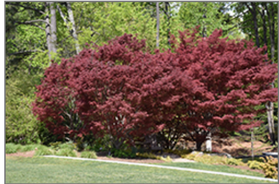
Suminagashi Japanese Maple