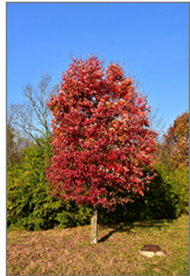
Autumn Flame Red Maple in fall