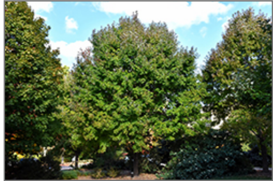
Autumn Flame Red Maple

This tree should only be grown in full sunlight. It is quite adaptable, preferring to grow in average to wet conditions, and will even tolerate some standing water. It may require supplemental watering during periods of drought or extended heat. It is not particular as to soil type, but has a definite preference for acidic soils, and is subject to chlorosis (yellowing) of the foliage in alkaline soils. It is somewhat tolerant of urban pollution. This is a selection of a native North American species.