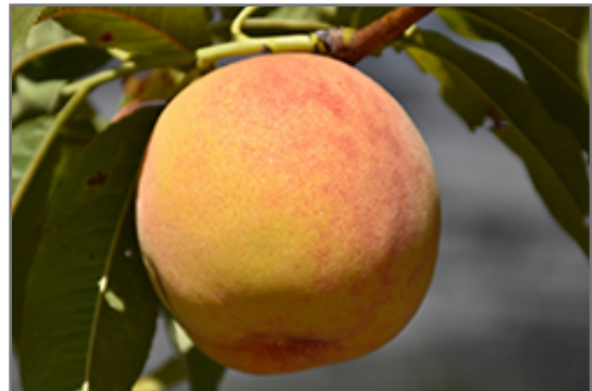
Reliance Peach fruit

Reliance Peach is clothed in stunning clusters of fragrant pink flowers along the branches in early spring, which emerge from distinctive rose flower buds before the leaves. It has dark green deciduous foliage. The narrow leaves turn yellow in fall. The fruits are showy yellow drupes with a red blush, which are carried in abundance in mid summer. The fruit can be messy if allowed to drop on the lawn or walkways, and may require occasional clean-up.