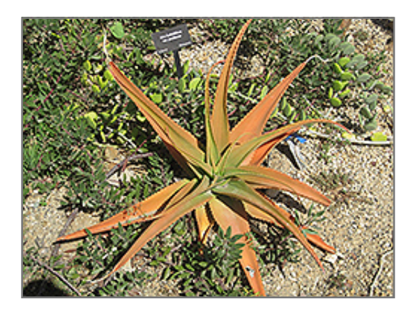
Paulian Aloe