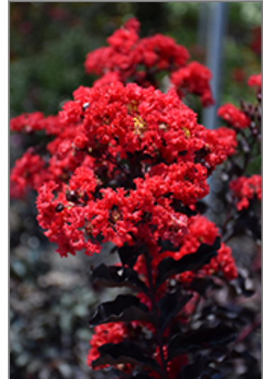
Black Diamond Best Red Crapemyrtle flowers