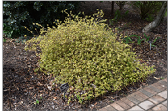
Twist of Orange Glossy Abelia