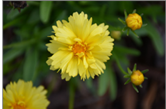
Leading Lady Charlize Tickseed flowers