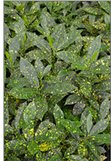
Gold Dust Variegated Croton foliage