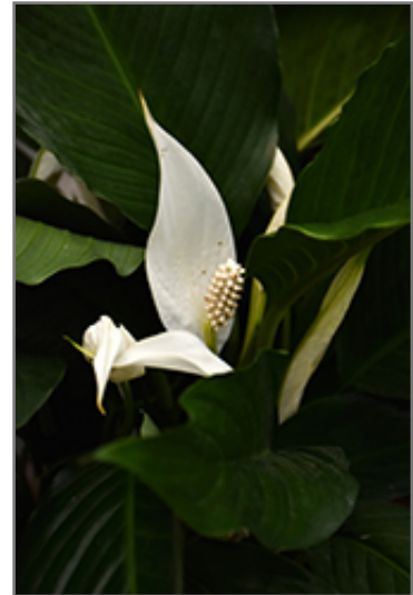
Peace Lily flowers