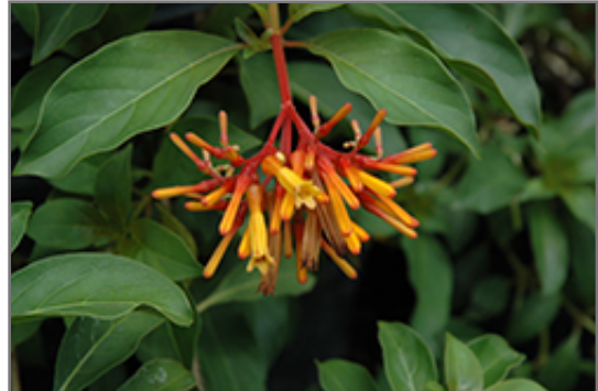
Dwarf Firebush flowers