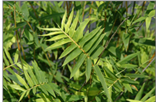
Hedge Bamboo foliage