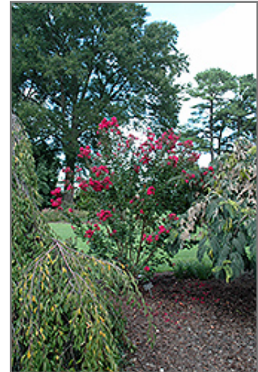
Pink Velour Crapemyrtle in bloom