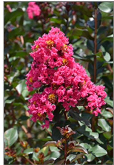
Pink Velour Crapemyrtle flowers