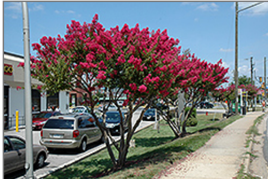
Tuskegee Crapemyrtle in bloom