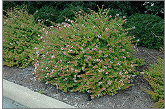
Rose Creek Abelia in bloom

Rose Creek Abelia is recommended for the following landscape applications;