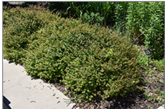
Rose Creek Abelia

* This is a 'special order' plant - contact store for details