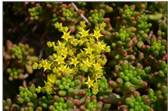
Jelly Bean Plant flowers

Jelly Bean Plant will grow to be only 5 inches tall at maturity, with a spread of 14 inches. When grown in masses or used as a bedding plant, individual plants should be spaced approximately 10 inches apart. Its foliage tends to remain low and dense right to the ground. It grows at a medium rate, and under ideal conditions can be expected to live for approximately 10 years. As an evergreen perennial, this plant will typically keep its form and foliage year-round.