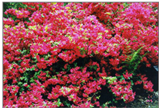
Hino Red Azalea in bloom