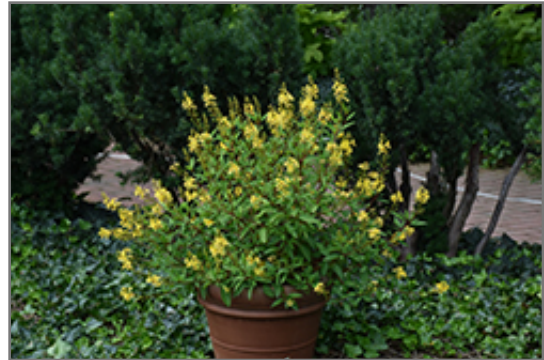
Thryallis in bloom