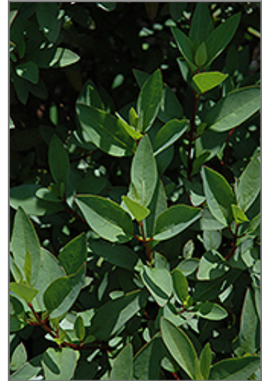
Thryallis foliage

This shrub does best in full sun to partial shade. It is very adaptable to both dry and moist growing conditions, but will not tolerate any standing water. It may require supplemental watering during periods of drought or extended heat. It is not particular as to soil pH, but grows best in sandy soils. It is somewhat tolerant of urban pollution. Consider applying a thick mulch around the root zone in winter to protect it in exposed locations or colder microclimates. This species is not originally from North America.