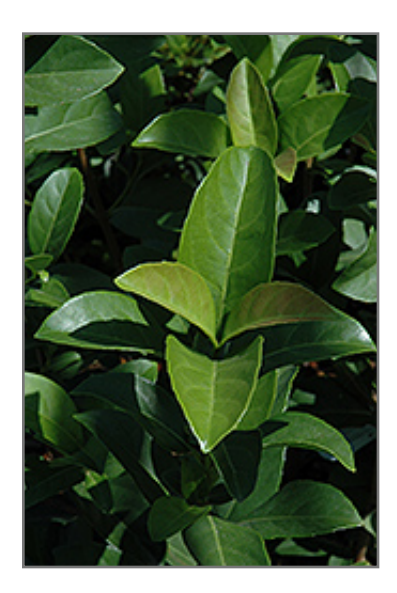
Sandanqua Viburnum foliage