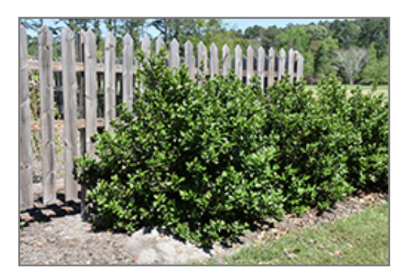
Sandanqua Viburnum

Sandanqua Viburnum is recommended for the following landscape applications;