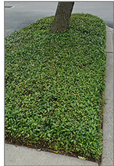
Asian Jasmine