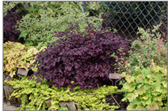
Crimson Fire Chinese Fringeflower