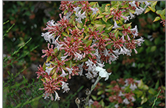
Francis Mason Abelia flowers

Francis Mason Abelia is recommended for the following landscape applications;