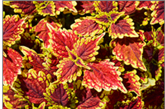
Oxford Street Coleus foliage