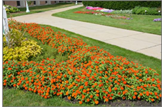
Profusion Double Fire Zinnia in bloom

Profusion Double Fire Zinnia is a fine choice for the garden, but it is also a good selection for planting in outdoor containers and hanging baskets. It is often used as a 'filler' in the 'spiller-thriller-filler' container combination, providing a mass of flowers against which the larger thriller plants stand out. Note that when growing plants in outdoor containers and baskets, they may require more frequent waterings than they would in the yard or garden.