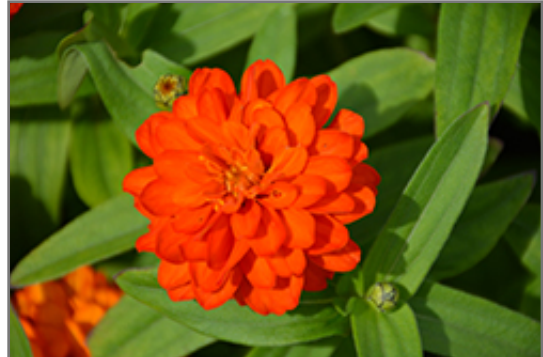
Profusion Double Fire Zinnia flowers