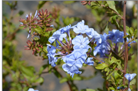
Imperial Blue Plumbago flowers

Imperial Blue Plumbago is recommended for the following landscape applications;