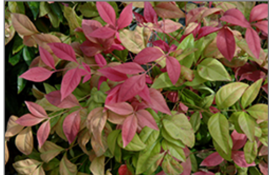
Blush Pink Nandina foliage