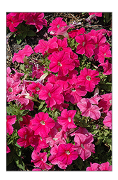
Pretty Grand Deep Pink Petunia flowers

Pretty Grand Deep Pink Petunia will grow to be about 8 inches tall at maturity, with a spread of 12 inches. When grown in masses or used as a bedding plant, individual plants should be spaced approximately 10 inches apart. Its foliage tends to remain low and dense right to the ground. This fast-growing annual will normally live for one full growing season, needing replacement the following year.