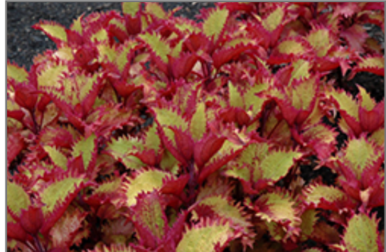
Henna Coleus foliage