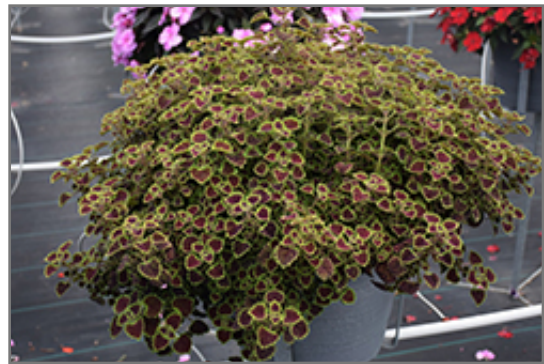
Burgundy Wedding Train Coleus