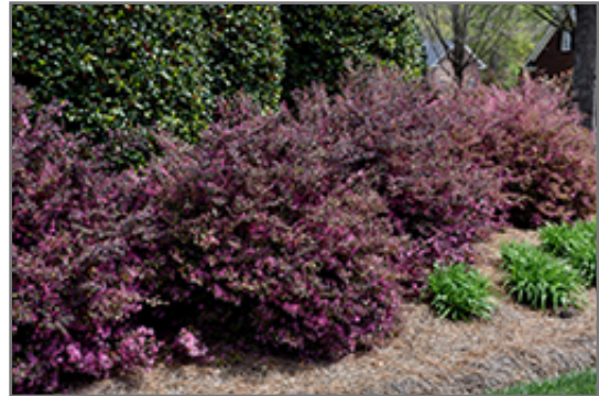
Purple Diamond Fringeflower in bloom