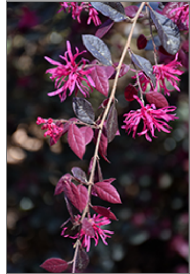
Purple Diamond Fringeflower flowers

Purple Diamond Fringeflower is recommended for the following landscape applications;