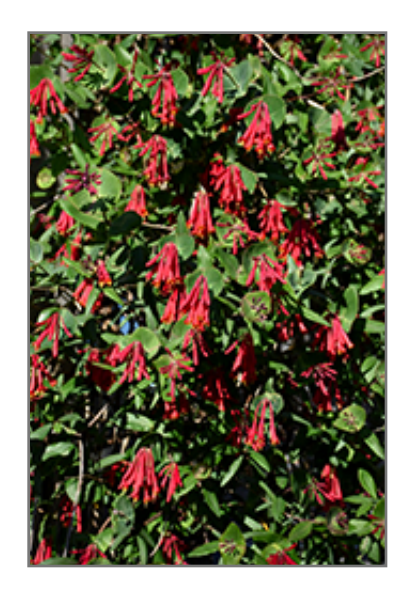
Major Wheeler Coral Honeysuckle flowers

This woody vine should only be grown in full sunlight. It does best in average to evenly moist conditions, but will not tolerate standing water. It may require supplemental watering during periods of drought or extended heat. It is not particular as to soil type or pH. It is somewhat tolerant of urban pollution. Consider applying a thick mulch around the root zone in winter to protect it in exposed locations or colder microclimates. This is a selection of a native North American species.