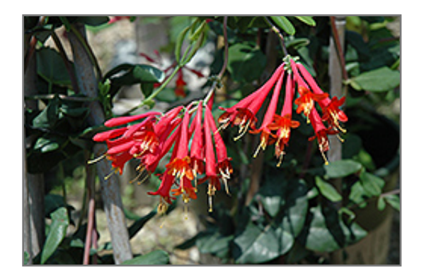
Major Wheeler Coral Honeysuckle flowers