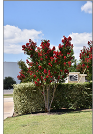
Dynamite Crapemyrtle in bloom