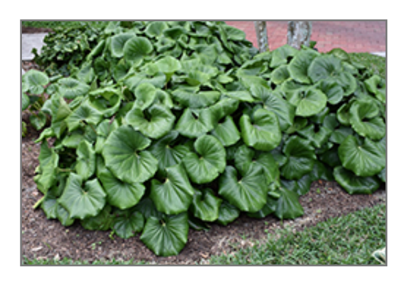
Giant Leopard Plant

Giant Leopard Plant is recommended for the following landscape applications;