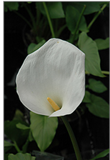
Calla Lily flowers